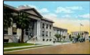
College of Medicine in downtown Phoenix, location of 2007 Navigating Breast Cancer event.

Saturday, September 29, 2007, is the date for the next Bosom Buddies Day breast cancer forum entitled "Navigating Breast Cancer ~ 2007, Your Journey to Knowledge and Advocacy." This forum is open to all breast cancer survivors and the community at large.