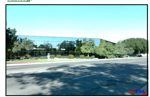
Bosom Buddies New Office on 28th Drive north of Peoria Avenue in Phoenix, Arizona.

Our phone number remains the same 602-265-2776, fax: 602-279-5857. . . . Emails can go to info@BosomBuddies-AZ.org .✳